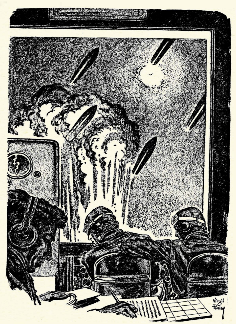
At last the long awaited formation appeared on the screen.